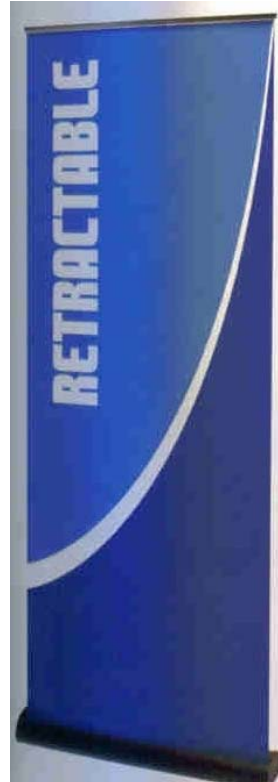
Retractable banner with stand

A receipt from the printer (FASTSIGNS, Greenfield, WI) indicating full amount charged on listed credit card will be mailed with the banner. Sales tax rate is 5.5%.